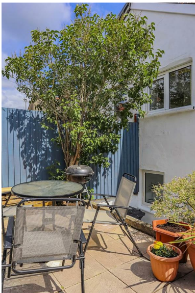
Fairford Street, Barry, CF63 1BY